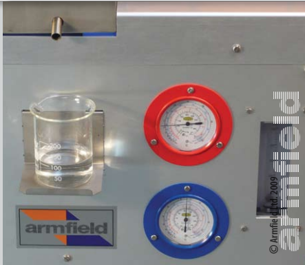
Detail of the RA3