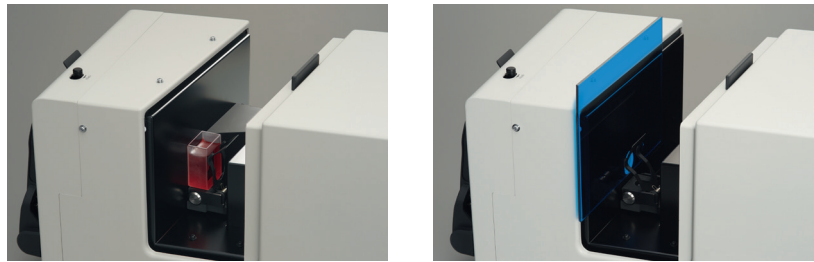
Sideless transmittance chamber for unlimited sample length (Maximum thickness: Approx. 50 mm).

To measure the spectral characteristics of transparent or translucent samples, the large and accessible transmittance chamber of the CM-3700A offers a high level of flexibility in terms of measurable sample size. Specially designed accessories are available for the optimum accuracy and repeatability of measurements of liquid samples or PET-preforms.