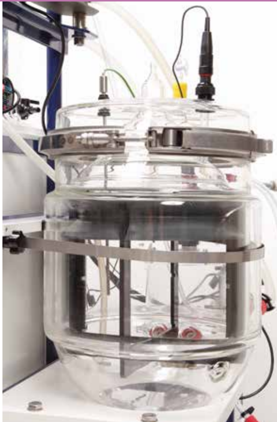
Tank Reactor showing detail of baffles, deflector and lid configured as UASB (Upflow Anaerobic Sludge Blanket Reactor)