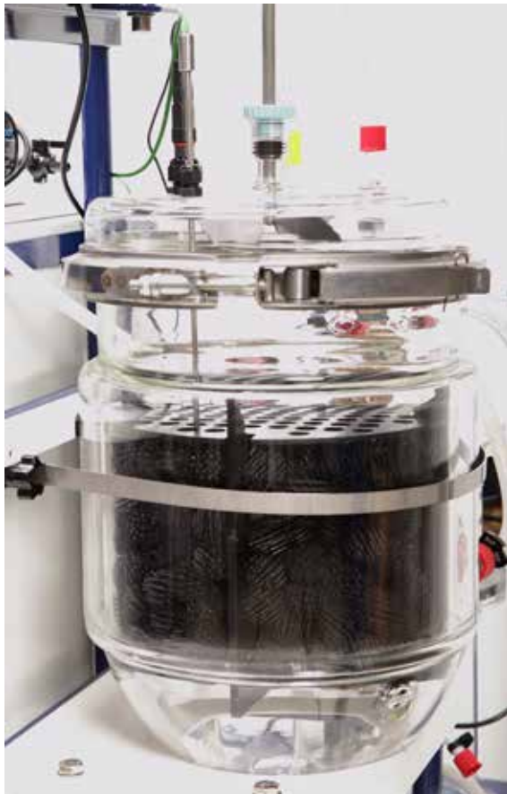
Tank Reactor showing detail of bio-balls and supports, configured as PBR (Packed Bed Reactor)