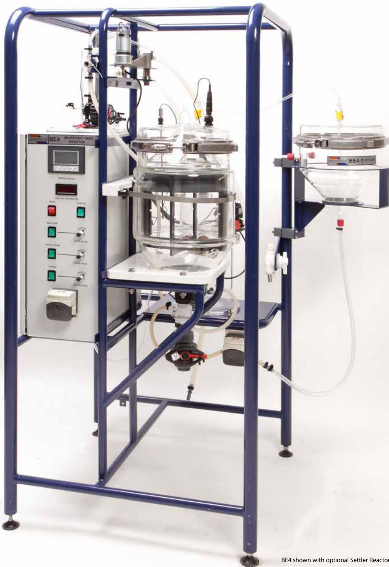
BE4 shown with optional Settler Reactor BE4-1