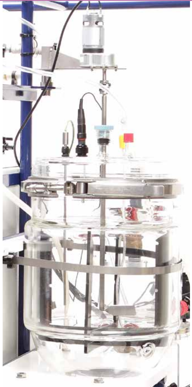
BE4 configured as CSTR (Continuous Stirred Tank Reactor)