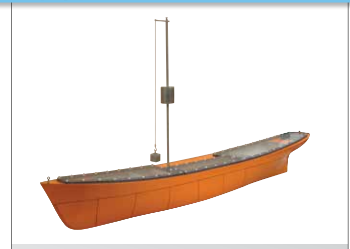
NA8-14 Trawler Model