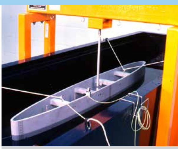
Ships Vibrations Test Model - NA4-10

The NA8-10 Large Angle Stability System (above) is designed for the study of ship hydrostatics and stability. A comprehensive manual provides hydrostatic stability and other data for ship models and includes a number of experiments which are useful to students. Exercises are conducted on a 1/70 scale model of a general cargo vessel of 28000 tonnes ship mass. Rolling, righting and the effects of flooding various compartments may be studied. Optional alternative ships models are also available for study.