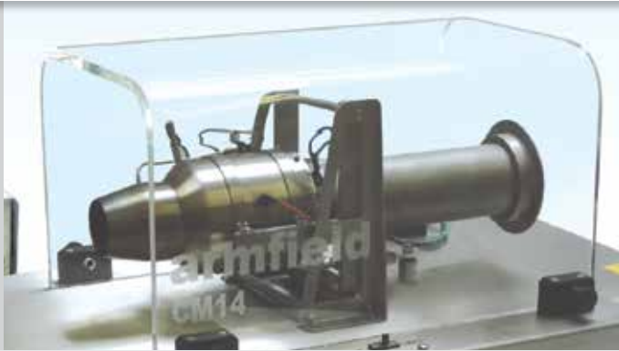
CM14 with safety screen in place