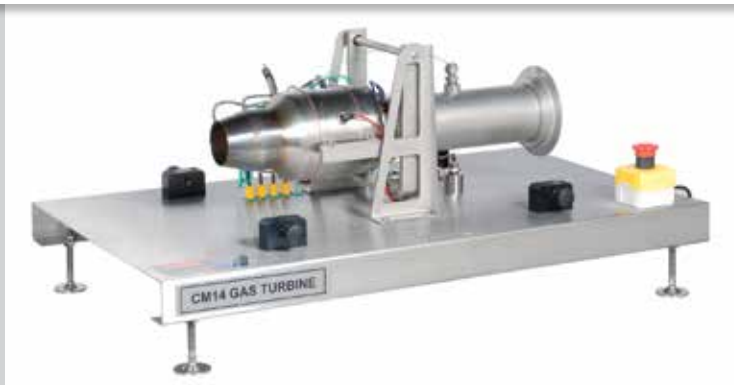
CM14 Bench-top option. Cover removed for clarity