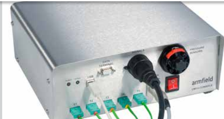
CM14 Console detail