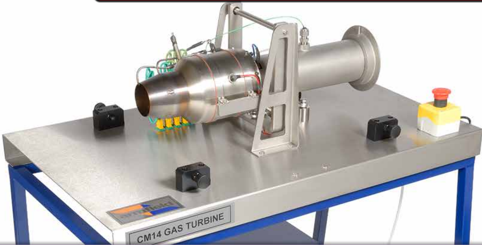
CM14 Frame mounted version. Shown with cover removed for clarity

NEW IMPROVED STARTING SYSTEM - NO NEED FOR PROPANE GAS OR COMPRESSED AIR