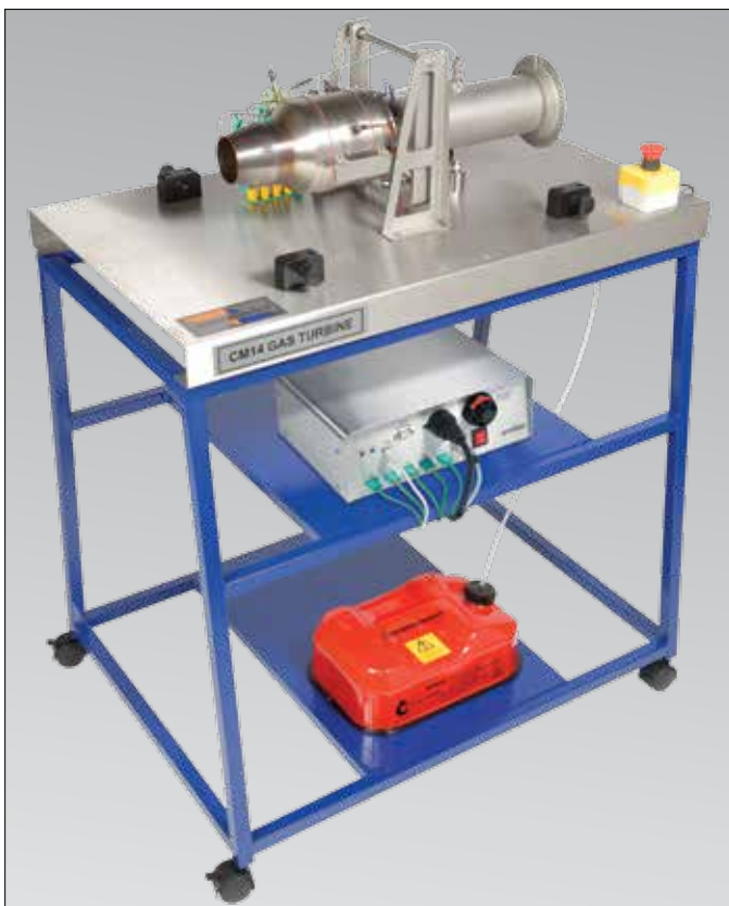
CM14 Frame mounted version. Shown with cover removed for clarity